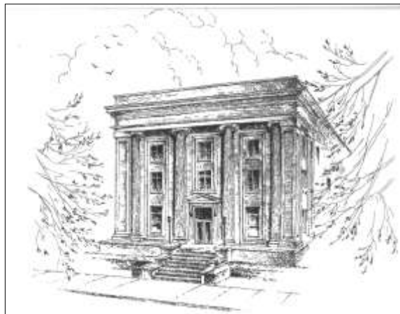
A sketch of the Johnson County Museum in Franklin, Indiana

Founded in 1931 by the Alexander Hamilton Chapter of the Daughters of the American Revolution, the Johnson County Museum of History in Franklin first used a room in the southwest corner of the courthouse. The DAR's Museum Committee managed the collection that was moved in 1963 to a home donated to the Museum. The Historical Society and Johnson County purchased the former Masonic Temple and moved the museum there in 1991 ( https://co.johnson.in.us/jcmuseum )